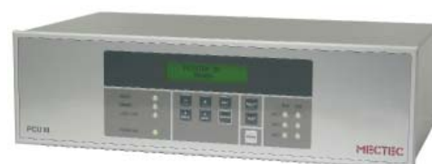
Printer Control Unit PCU III